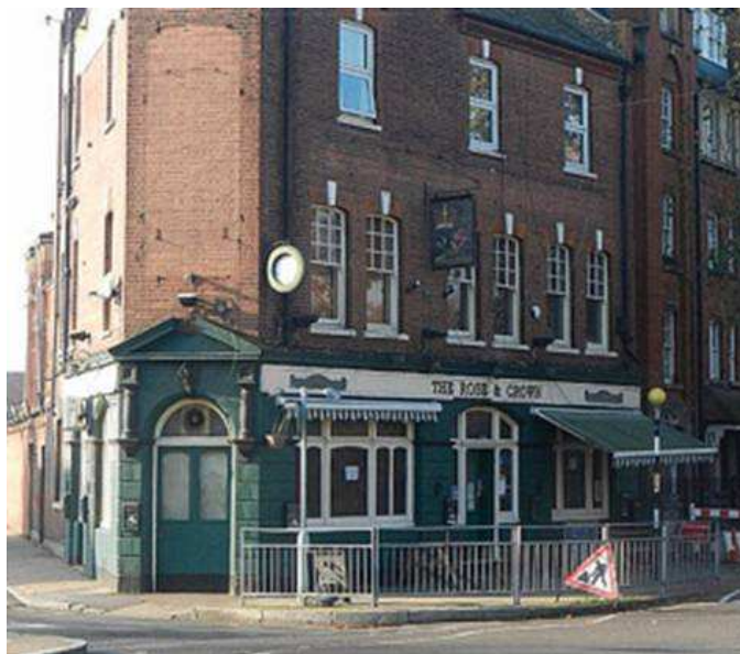
Rose & Crown PH

The developers of the Rose and Crown on the corner of Wadding Street and Rodney Road wanted to change the usage of the ground floor from an A4 pub usage to a more general commercial usage (A1/A2/A4). The combination of significant work by the East Walworth councillors and our own campaigning appeared to encourage the developer to rethink this and it appears that planning permission has been granted for A4 usage only.