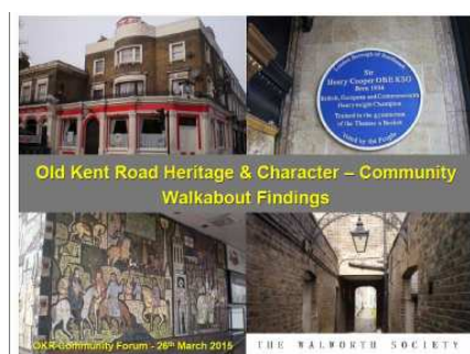
Cover of Presentation to OKR Forum

Old Kent Road Community Forum. Along with many other groups we have been regular attendees at the OKR Community Forum which has been meeting in 2015. The Society led a walkabout on the historic character of the OKR and presented to the Forum about it.