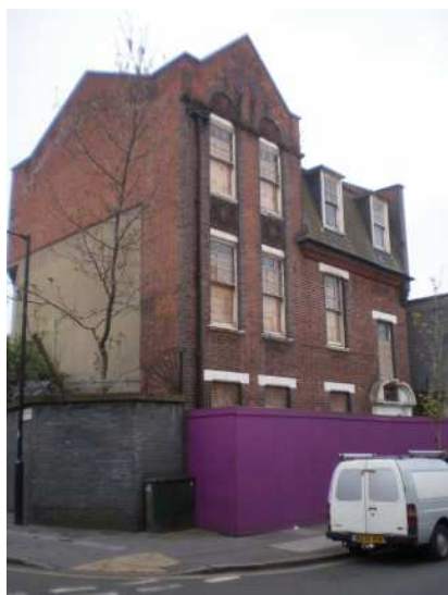
Manor Place Depot Coroner's Court Building

Manor Place Depot. In late 2015 Notting Hill Housing obtained planning permission for the redevelopment of the Manor Place Depot site and as part of that permission it was confirmed that they will be refurbishing the former Coroner's Court building.