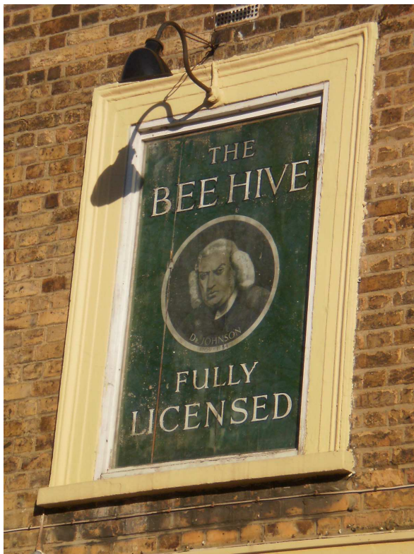
Detail of Historic Sign